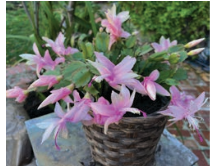
Cynthia's Christmas cactus is in full bloom for the holidays.