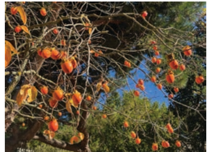
Perfect persimmons shimmer on the tree.