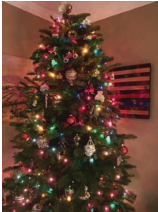
A living Christmas tree shines brightly decorated with favorite family ornaments,

When it comes to Christmas cherished memories, live trees offer the biggest bang of tradition and aesthetics. While artificial trees are practical and cost-effective, the joyous experience of choosing a living tree creates a connection to nature and environmental sustainability. Purchasing a live tree supports agricultural endeavors as