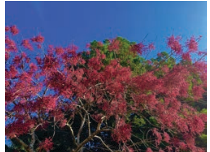
Profuse clusters of pink pistache berries are elegant additions to wreaths.